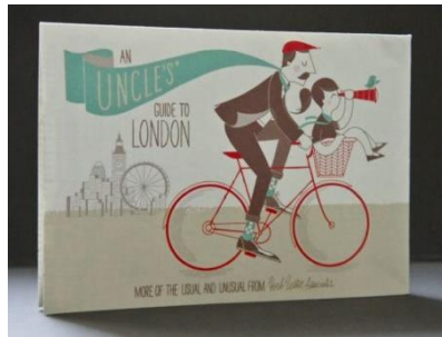
Herb Lester Associates— Simplified Vector